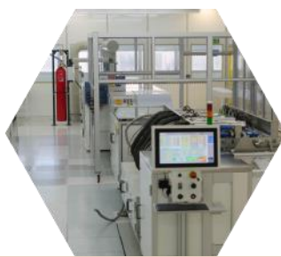
Production of CNTs