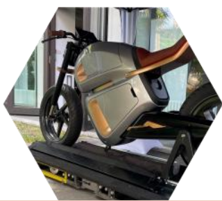
Application: energy storage