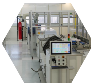
Production of CNTs