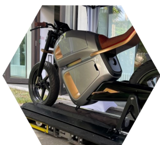
Application: energy storage